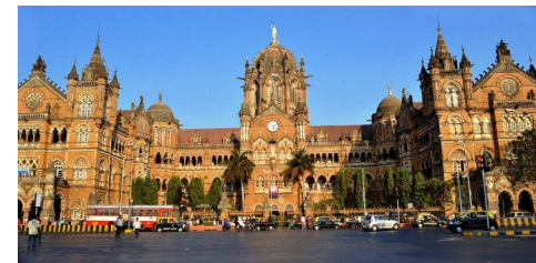
Chhatrapati Shivaji Terminus