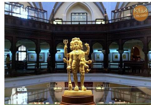
God Dattatreya Ivory in Chhatrapati Shivaji Maharaj Vastu Sangrahalay