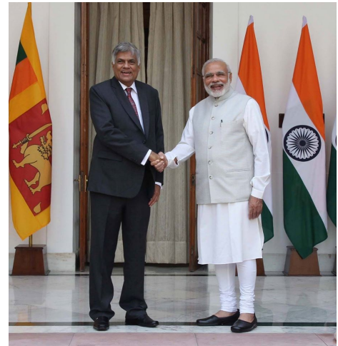
PM of Sri Lanka meets PM