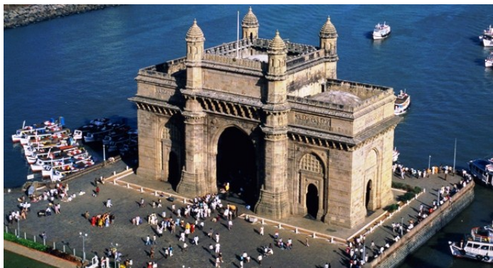
Gateway of India

Mahalakshmi temple, Siddhivinayak temple, Haji Ali Shrine, Sanyas ashram, Jehangir art gallery, National gallery of modern art, Dr. Bhau Daji Lad Museum, RBI Museum, Mani Bhavan, Marine drive and chowpatty beach and Mahatma jyotiba phule market are other tourist attractions in Mumbai.