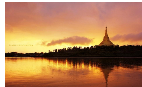
Global Vipassana Pagoda