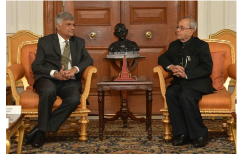
Prime Minister of Sri Lanka calls on President

In presence of the two Prime Ministers, four agreements were signed on 'Orbit frequency coordination of satellite for SAARC region', 'Supply of medical equipment to 200 bed ward complex at District General Hospital in Vavuniya', 'Establishment of Emergency Ambulance Services in Sri Lanka' and 'Renewal of MOU regarding Indian grant for implementation of Small Developmental Projects through local bodies, NGOs, charitable trusts, and education and vocational institutions'.